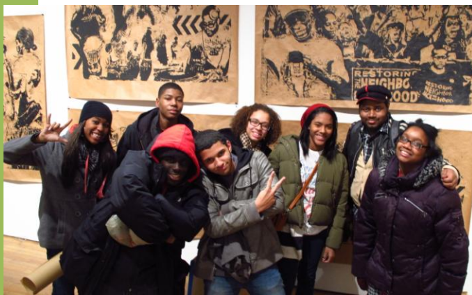
Detroit Summer youth and their graphics

On Saturday, Detroit Summer shared a glimpse of its programming by offering a youth-led workshop called Come With A Question, Leave With A Print. Cracking a window into their process, the workshop introduced the techniques they use to guide community members through identifying and exploring an issue, then producing media, which, in this case, was a screen print. Judging by their integration of art, activism, media literacy, and interviewing, among other skill sets, it draws inspiration from many different practices, fields, and sectors. The program has used this process to produce a number of creative products from t-shirts to large-scale screen prints to a hip-hop audio documentary CDs.