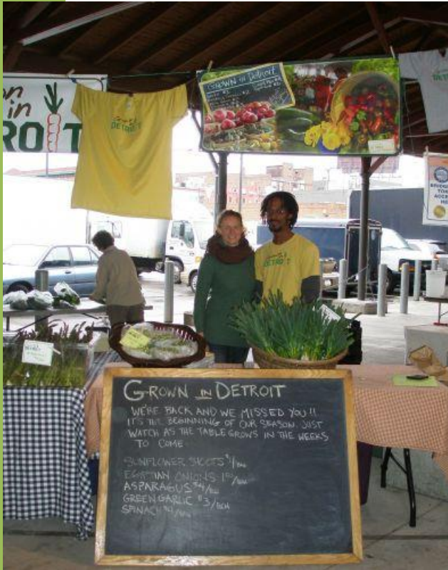
Detroit Eastern Market, © Eastern Market Corporation

to showcase the city’s emerging visual artists and offer event rental space to the creative community.