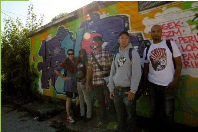
MicroFest participants visiting The Alley Project (TAP)

Many of us were magnetized by colorful mural walls, planted perpendicular to the street, reminding me of a double stack of oversized blackboards from my public elementary school. Rising from the bottom edge of the murals were graffiti style name “pieces” ringing bright in blue, green, purple, and shades of red and pink. Each piece was framed by competing layers of tags that made the pieces stand out, to look like what graffiti writers call “burners.” Above and below the walls, in the wooden frames used to erect the murals, were spray paint cans stacked together on their sides, leaving only the tops visible, forming a kind of three-dimensional mosaic tiling.