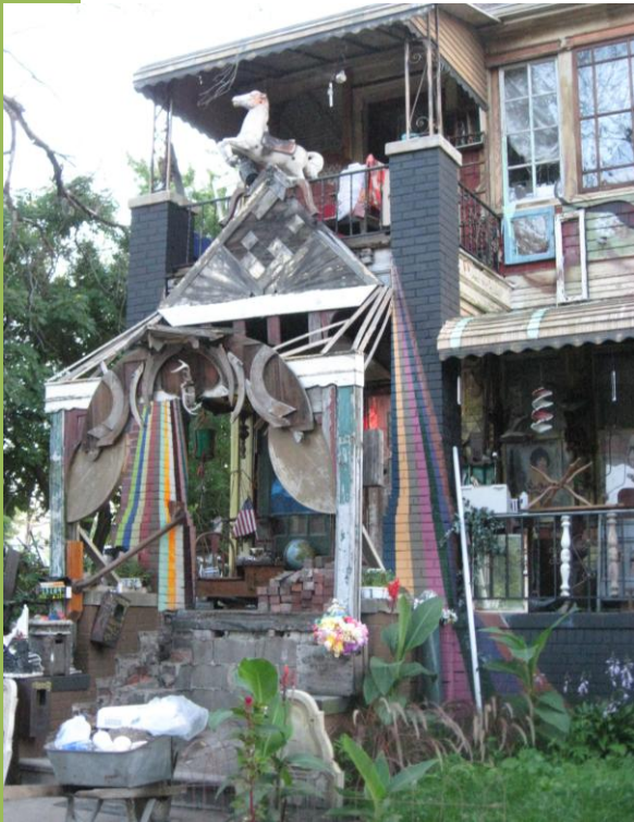
House transformed by Power House Productions, Banglatown neighborhood of Detroit

In an article for HowlRound , the digital theater journal, NET Executive Director Mark Valdez wrote, “The aim of this new cycle is to boost the national significance of local placemaking efforts by creating opportunities for learning exchange that can strengthen local endeavors while also inspiring similar work in other communities.” There is an abundance of transformative work happening across the country that is often overshadowed by the hyper-commercial and numbers-driven output models of top down commercialism and funding structures. But in places with diminished financial resources and where space is cheaper relative to local incomes and easier to access than