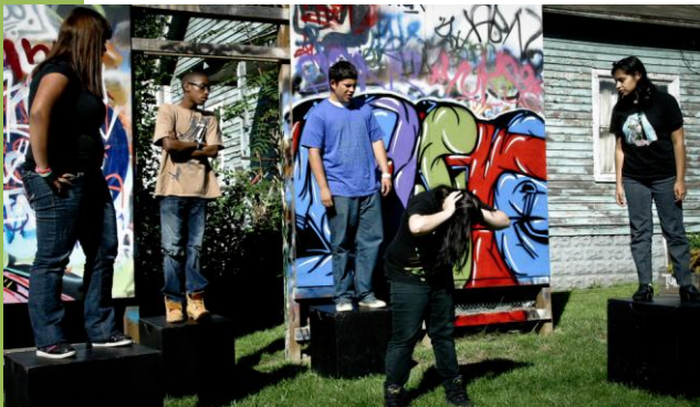
Matrix Theatre Company performs Detroit Dreaming in The Alley Project

Matrix's Detroit Dreaming is a collaboratively devised performance piece that takes on, as though trying to exorcise by confrontation, demoralizing negative perceptions of Detroit that its young creators are navigating. The stereotypes and misrepresentation they have to deal with are revealed through a series of pointed scenes. The situations that provide the conflict are inspired by actual experience or constructed in response to negative or misleading stories found on YouTube and other digital platforms that have become our modern, open-source encyclopedia society.