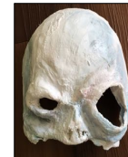
↑ Process and prototypes